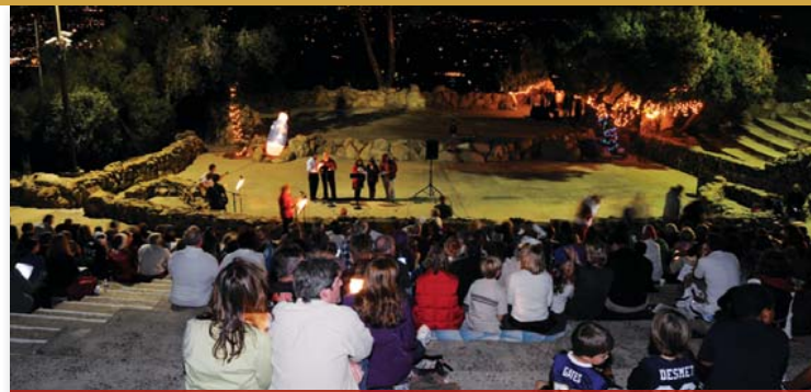
The amphitheater was aglow with the warmth of the holiday season.

Rumor has it that Santa Claus may also be making an appearance but his schedule was unconfirmed at press time. Be sure to check the Park website for updated caroling information, www.mthelixpark.org .