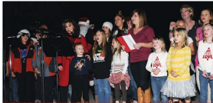
Rudolph the Red Nosed Reindeer was led by a group of children from the audience at last year's caroling event