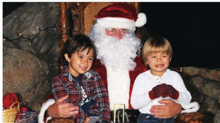
Children had a chance to sit on Santa's lap last year.