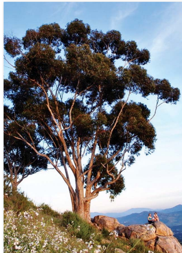
A view from Mt. Helix enjoyed by generations of Park visitors.

NON-PROFIT ORG. U.S. POSTAGE PAID San Diego Permit 906